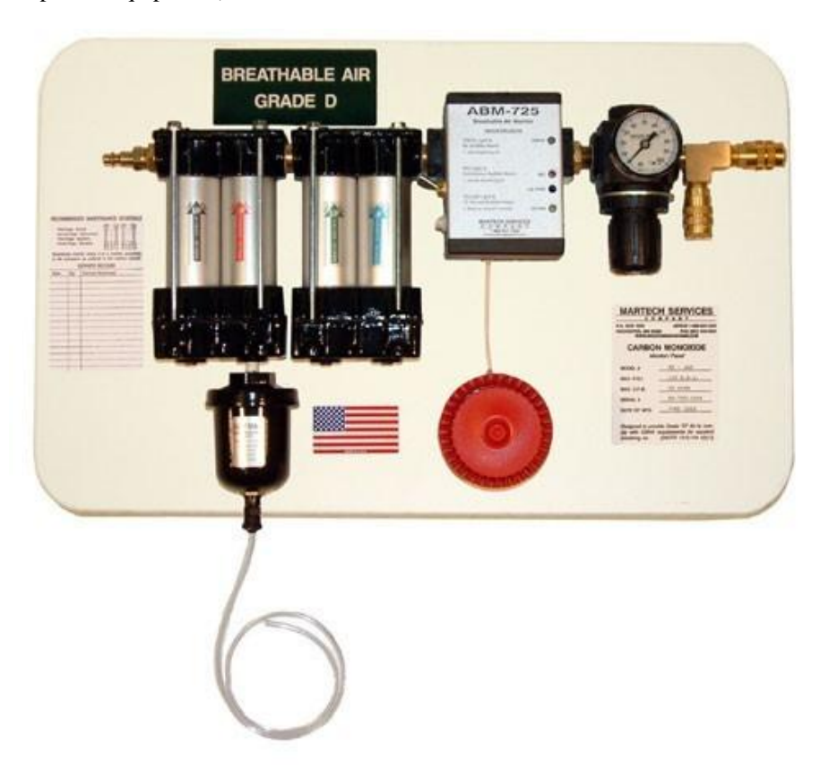
(Figure #1) Model 50 Systems Quality Air Breathing System (typical)

A complete Quality Air Breathing System consists of four stage filtration, automatic float drain, broad band monitor, audible and visual alarms, self relieving regulator with gauge, and quick connects, all panel mounted. This system is designed to be used with a NIOSH/MSHA approved air supplied respirator. (available as optional equipment.)