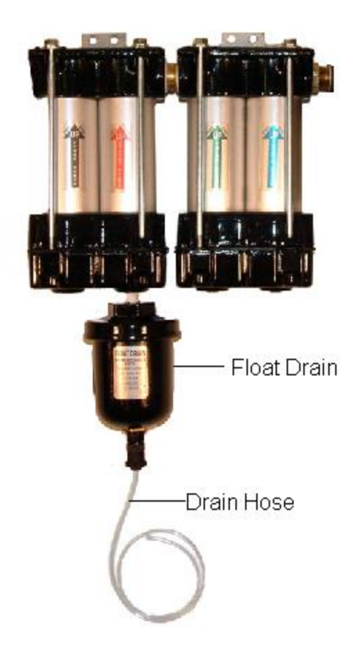
(Figure #3) Float Drain